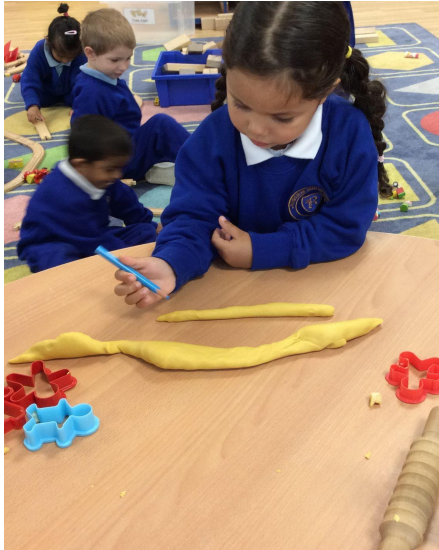
Expressive Arts and Design Mathematics