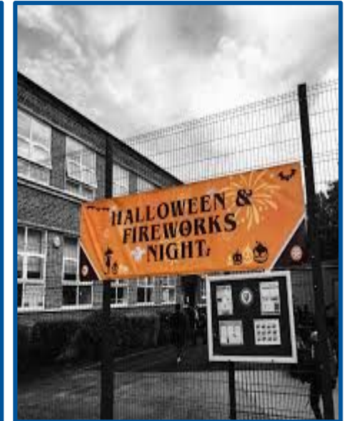
Halloween and Fireworks Night