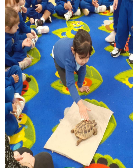
Pets and Vets