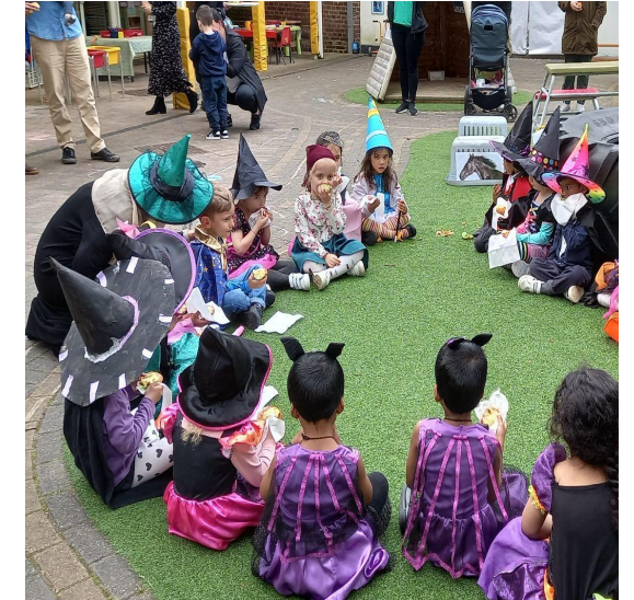
Witches' Reading Party