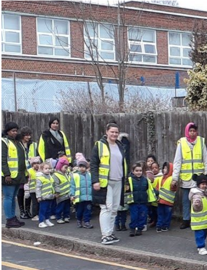
Local Area Walk