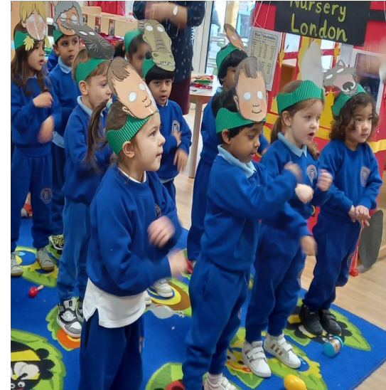
The Lion on the Bus Performance