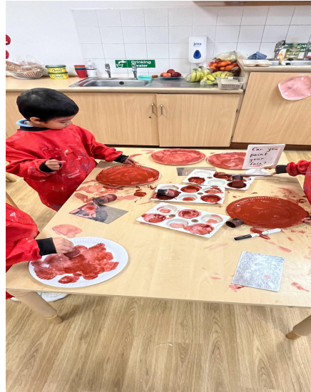
Expressive Arts and Design Understanding the World