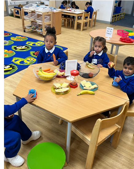
Personal, Social and Emotional Development