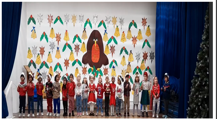
- Afternoon performance

We wish you all a restful holiday and thank you all for your continued support. We look forward to welcoming you back in 2024!