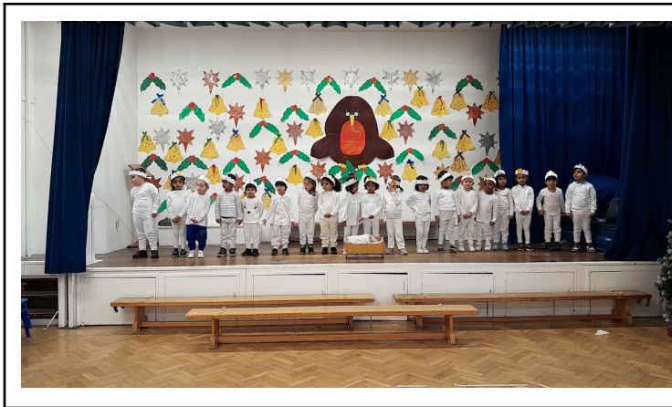
EYFS Nativity Videos Morning performance

Please practise these skills at home with your children.