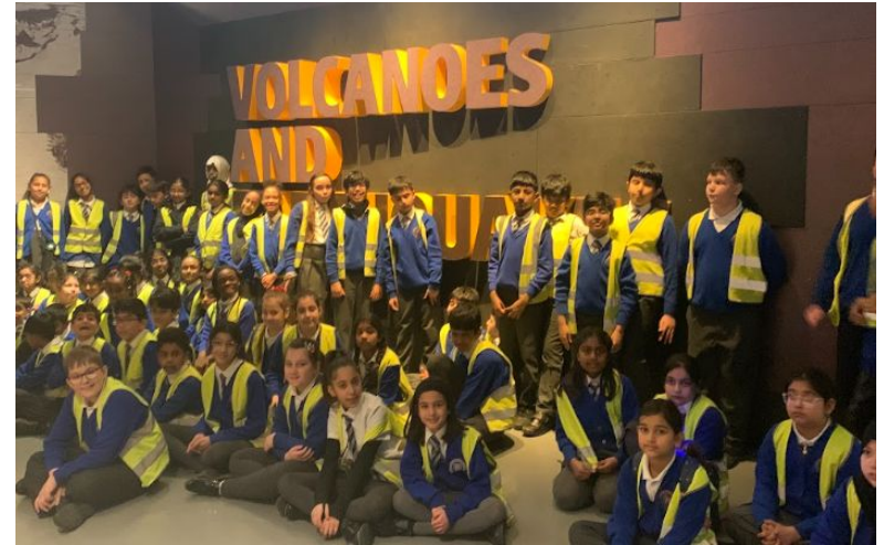
Residential (Year 5 Camping)