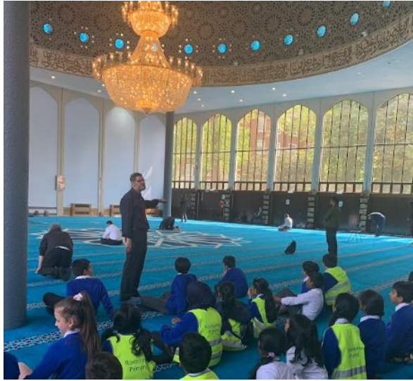
London Central Mosque (RE: Islam)