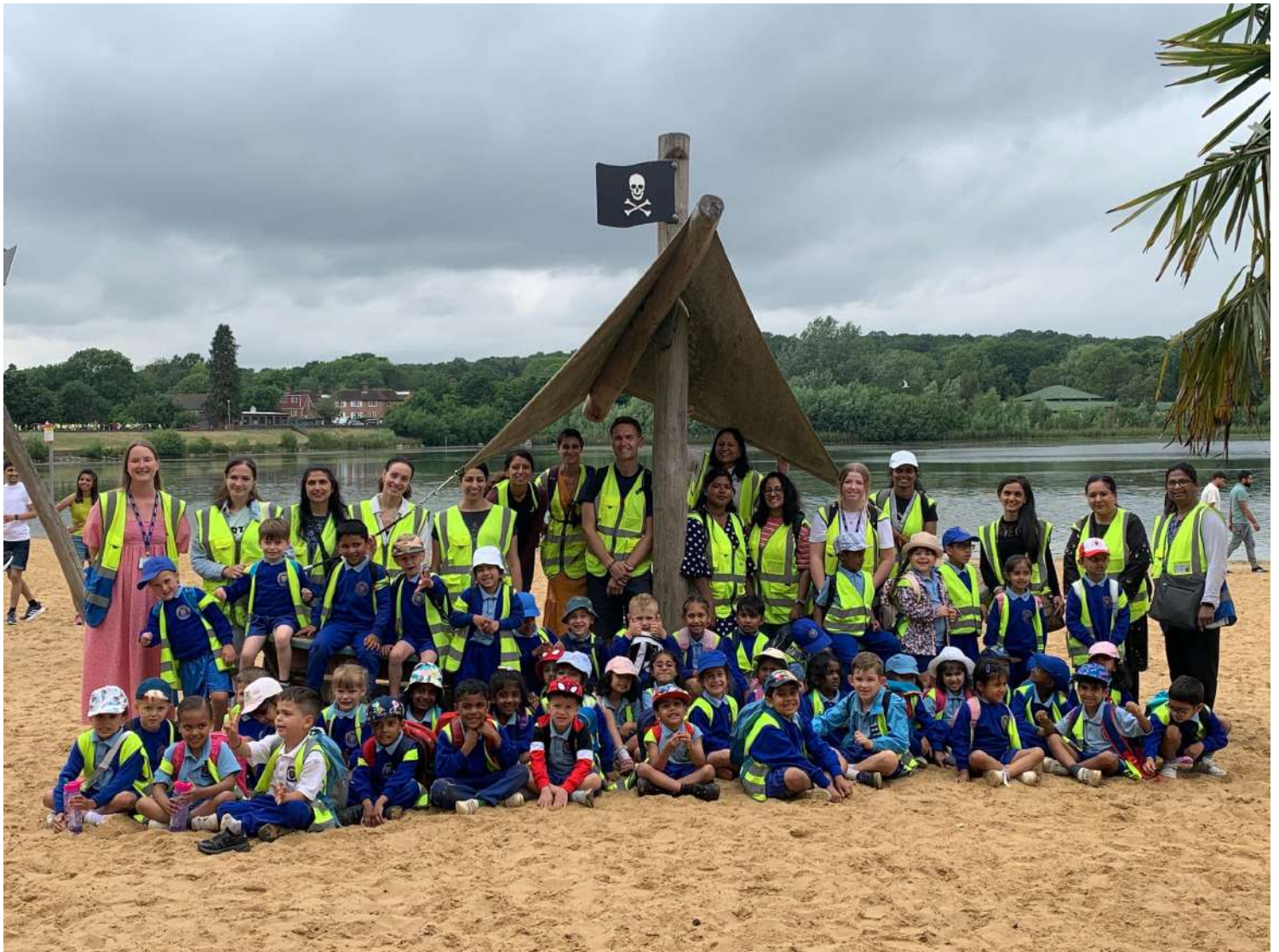
Reception Trip to the Ruislip Lido

everyone had a fantastic time exploring the facilities that the Lido had to offer. Not even a little unexpected rain could dampen our spirits. Instead we took cover for lunch and were quickly back out 'Living it Up at The Lido'. One of the highlights of the day came after lunch, with a lovely soft-serve flake cone. Yum! It was then back to the bus and a very slow and tired walk back to school where we poured out cups full of sand from our shoes and had enough time for a quick snack before it was time to go home and rest.