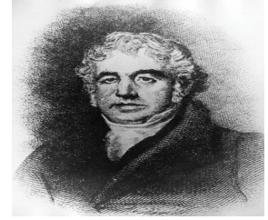
Charles Macintosh (1766-1843)

Ask you children why these 3 people are famous for their inventions and which new materials they invented in their lifetime.