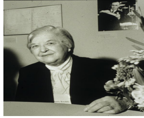
Carver Stephanie Kwolek (1923–2014)